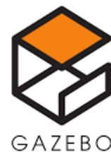
Figure 3: Gazebo